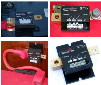
SmartFuse + Mounting Plate